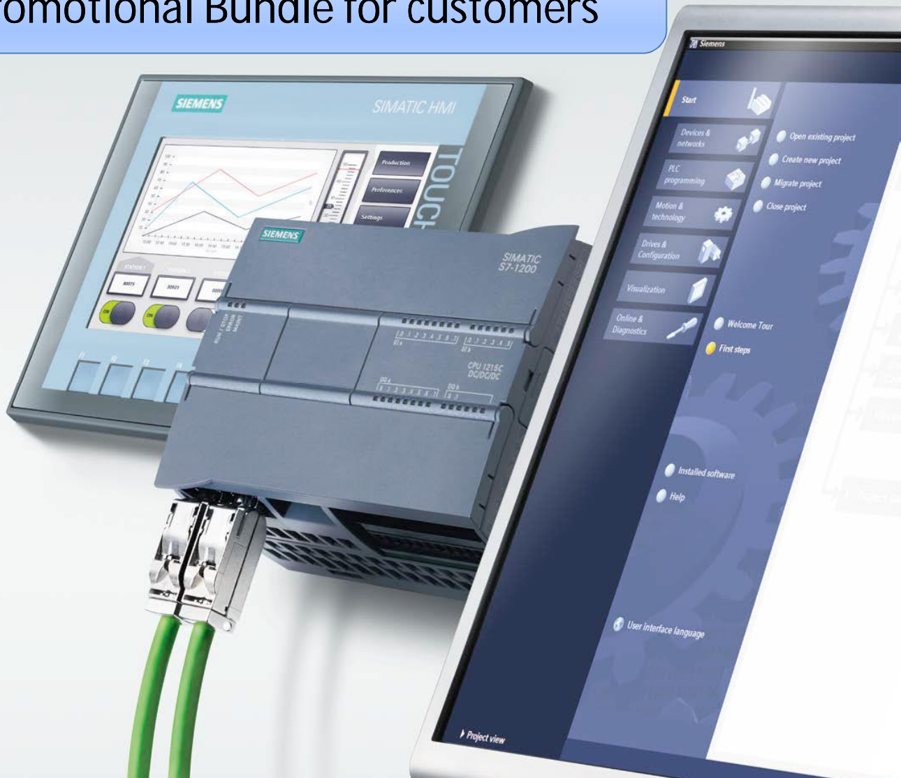
SIMATIC S7-1200 Basic Controllers (PLC), Basic Panels (HMI) and TIA Portal V13